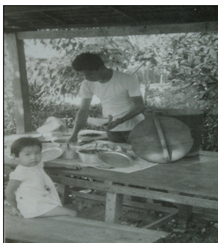
Fig. 6 One of the local food providers during previous days using wooden food barrel to steam the rice of nasi lemak.

“...The special thing about our nasi lemak are the rice is steamed to give better texture, served with one whole boiled egg unlike other seller who may serve half of it or less, and the special variety of side dishes served in our food stall. It took two hours per wooden barrel of rice and it is not an easy process but to maintain our food quality, we have to do this process. The rice will become fluffy in texture and people love it. This has been the main attraction of our customer since long time ago and we try to maintain it...” (local food provider 1).