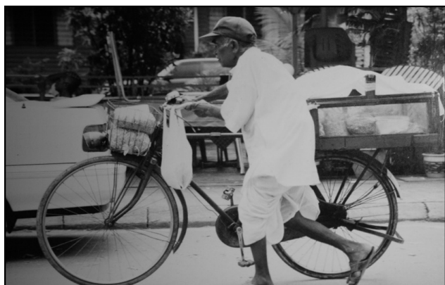
Fig. 5 Some food seller used bicycle to sell their foods.

Food providers also take advantages from the advance technology available nowadays whereby they use delivery services for example ‘GrabFood’ or ‘Foodpanda’ to deliver their foods to the customer such as practiced by local food provider 5. Even so, most of the local food