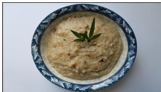
Fig. 2 Bubur lambuk sold in Kampong Bharu.

The culture in Kampong Bharu is different with previous days including the food selling activities. From the interview session with the local authority, it is known