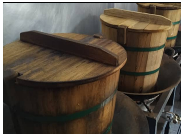
Fig. 7 Current wooden barrel used to steam the rice for making the steamed nasi lemak.